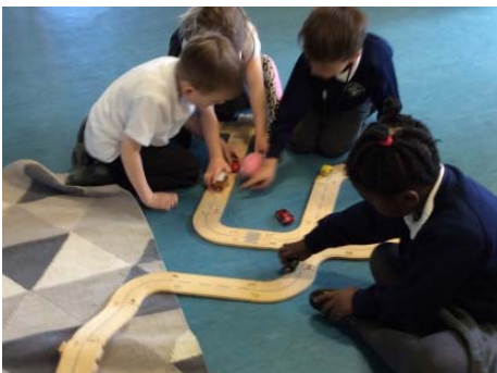
Trains and cars